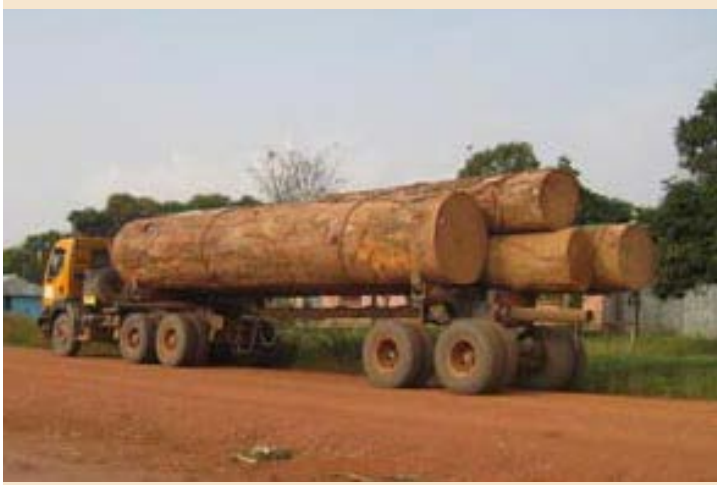
Central African Republic.