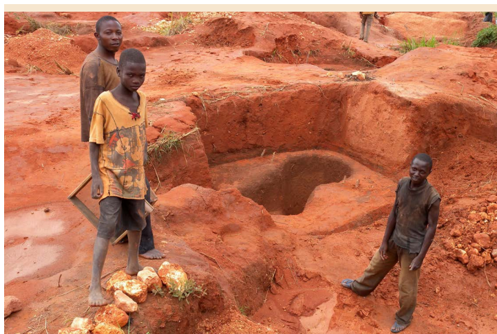
Democratic Republic of the Congo.